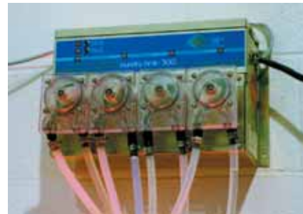
Microprocessor controlled chemical injection systems maximize cleaning efficiencies.

Your primary business is not managing a protective garment program – ours is. With a UniTech leasing program, we manage garment inventory, storage, maintenance, and LLW disposal. What's more, you will reduce your costs for peak-need reserves, storage, inventory, maintenance, and capital financing. Consider UniTech's Hybrid "ONE" Program combining the protective and cost features of both our lauderable and single use products.