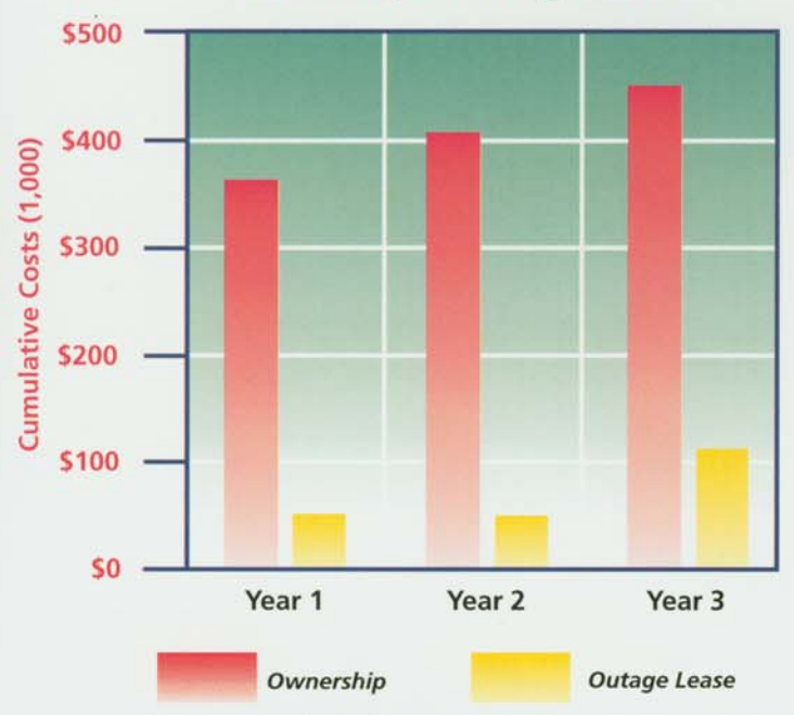
Three Year Savings: $354,000. Based on a 5,000 set peak inventory of protective clothing.