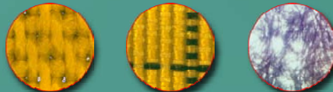
Poly-Cotton ProTech Plus PVA 18x Magnification

ProTech Plus incorporates high quality micro denier synthetic yarns which provide high barrier protection, flame resistance, and unsurpassed strength in arduous work environments.