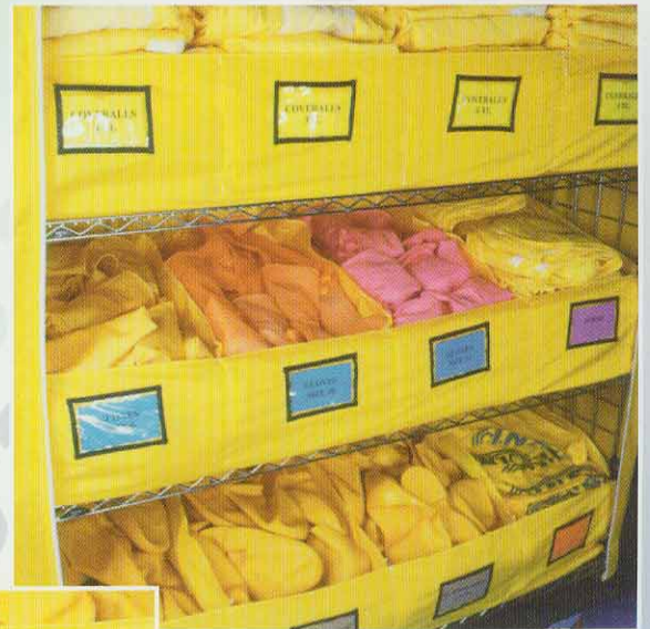
Roving Change Room!

For more information, contact your UniTech Account Manager or the UniTech Plant Manager servicing your facility.